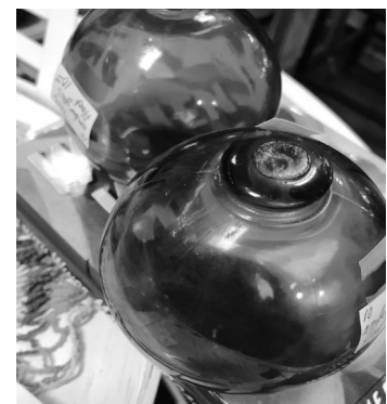
Uncommon Brown Floats

Who knew? Fishing floats are a great recycled collectible artifact. They were made in places all over the world, but best known to us are the Japanese floats