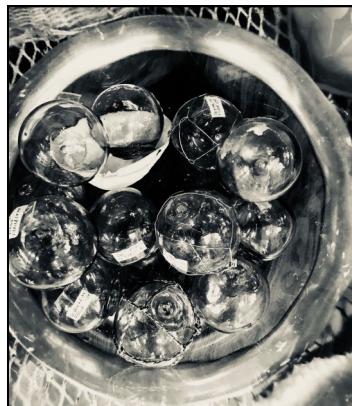
Small floats at Finders

Floats range in size from golf ball to soccer ball size and the colors range from aquamarines and greens to browns and more rarely, yellows. Floats that are bright reds or blues or vivid yellows are in most cases floats made as curios and not actually fishing floats. They are thinner and more polished looking than real working floats, where all that mattered was could they float and do their job? They are usually sealed with a blob called a button and if they are marked that's normally where you will find the mark.