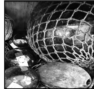
Floats come in many sizes

Here in the Pacific Northwest we are the accidental recipients of a gift from the sea, glass floats. These wonderful collectibles may have been at sea for well over ten years before they washed ashore on our beaches. Ocean currents create a great big circle and the floats from fishing nets that are long gone bob and float and drift in this pattern until a big storm breaks the circle for a few days and some of them head for shore with the weather. Most fishing floats lost in the Pacific land up in Oregon, Washington, and Alaska and after major storms lucky finders just might come upon one on a sandy beach.