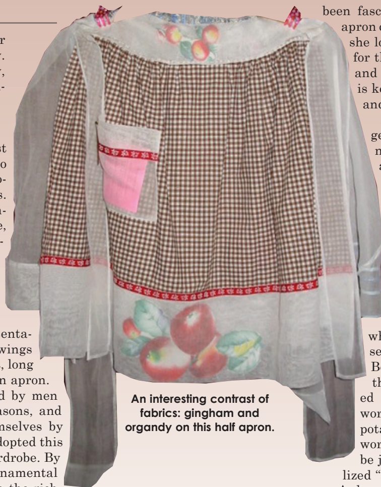
An interesting contrast of fabrics: gingham and organza on this half apron.