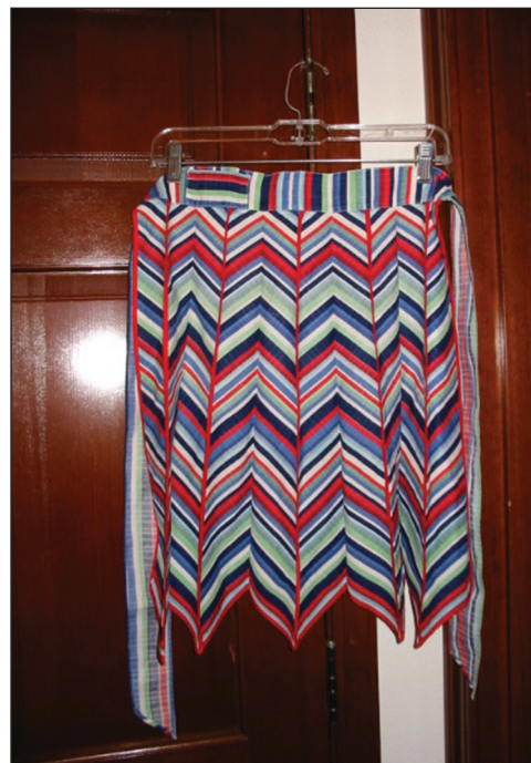
Above: So what was the function of the little pocket on the waistband of this apron? Maybe a place to stash a hankie?