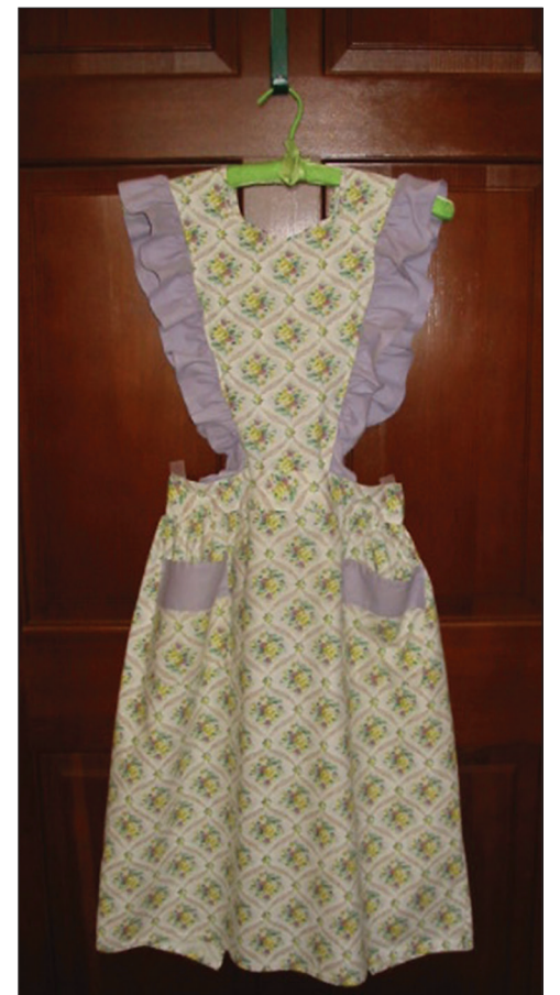
Above: A ruffled bib apron that, for the lucky woman with a small waistline, was very flattering as well as practical.