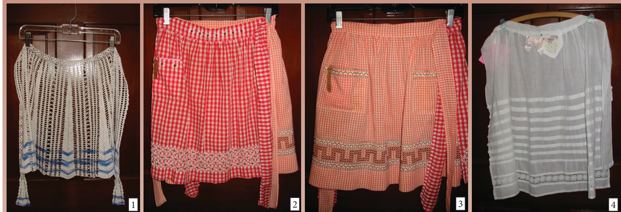
Above Left (1): For a woman who possessed needle skills and a bit of cotton thread (if not a lot of money), a crocheted hostess apron could be hers. Crocheted aprons were made in different colors and a variety of patterns. Above Middle Left (2): A combination of cross stitching and embroidery resulted in a cheerful apron adorned with flowers. Above Middle Right (3): Gingham aprons often served as a canvas for a stitcher's artistry. Here, black thread was used to attach white rickrack. Above Right (4): Note the tucks and inlay on this white-on-white apron.