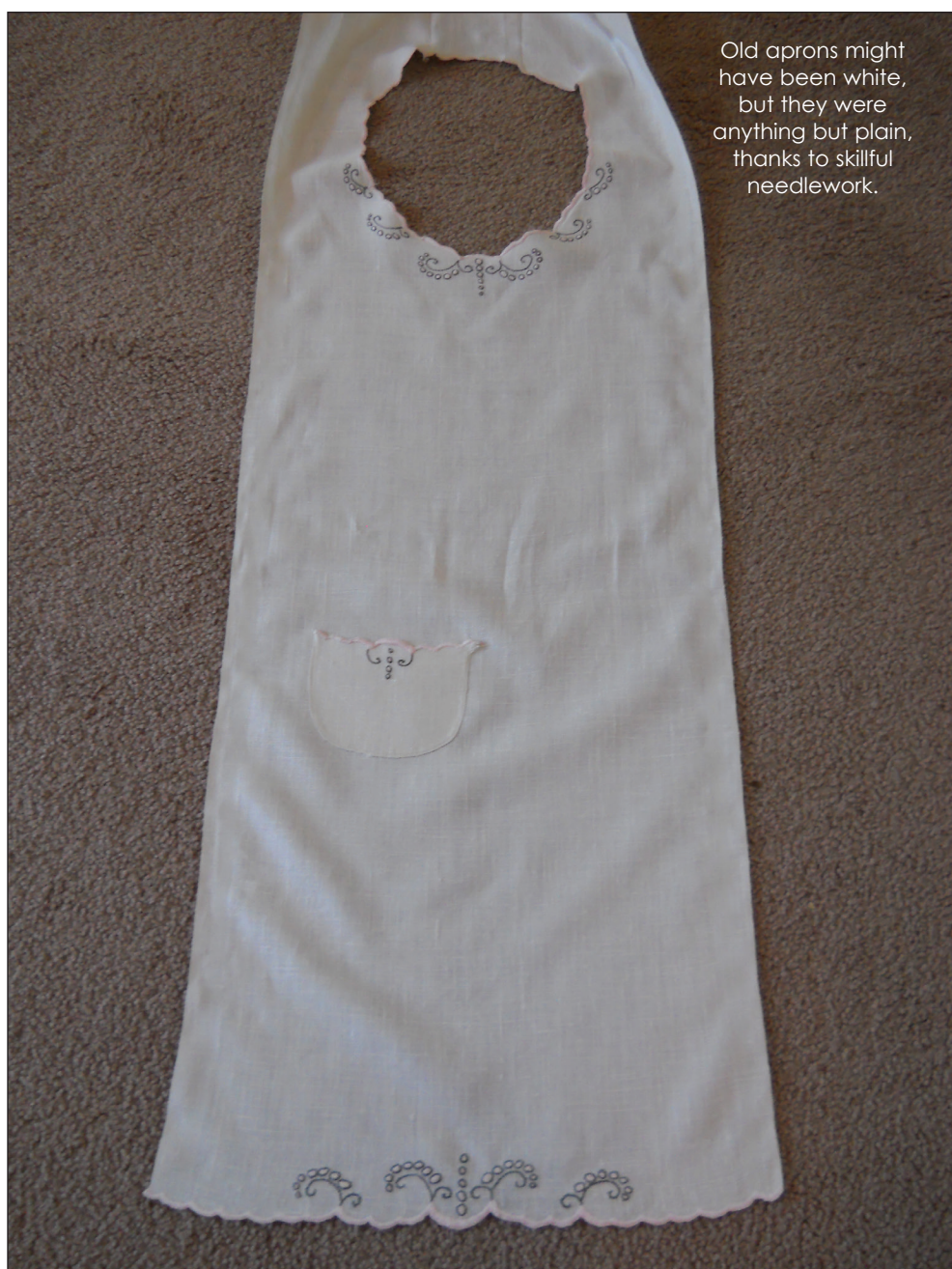
Old aprons might have been white, but they were anything but plain, thanks to skillful needlework.

Below: Note the wide ties on this bib apron. As women had more money, they could afford to use extra yardage to make long ties, according to Teresa Stone.