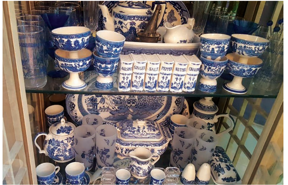
Above: From spice canisters to frosted glasses, egg cups to footed sherbet dishes, "Blue Willow" has a comfortable feel.