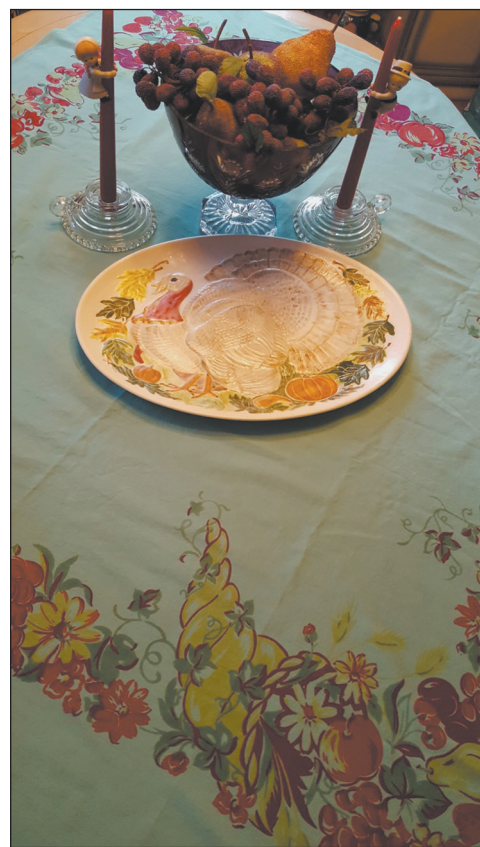
Right: Boughs of holly are not the only thing to decorate the halls with. . . collectors enjoy their vintage tablecloths year around.

Souvenir of South Dakota, 30 by 38 inches, $145.