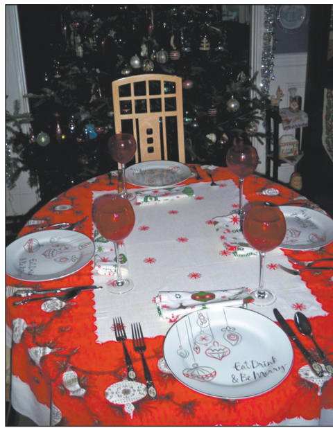
Above: Vintage tablecloth collectors can enjoy their collections, one (or two or more) cloths at a time. There is always a cloth on both the kitchen and dining room tables at Jimmie Bucci's house.

Below (Bottom): Vintage tablecloths were originally meant to add color and style to informal dining, but today, they are the object of many collectors' affections.