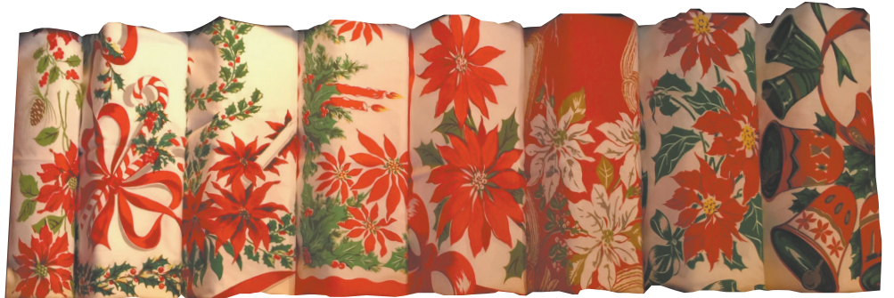
Above: 'Tis the season to be jolly, as reflected in the cheerful traditional patterns of these Christmas tablecloths.