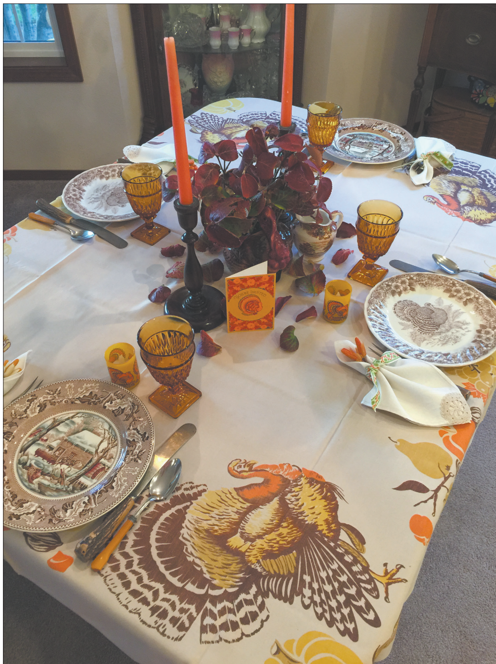
Above: Vintage tablecloth collectors welcome Thanksgiving, a holiday centered around the table. But they know that Christmas is just around the corner.