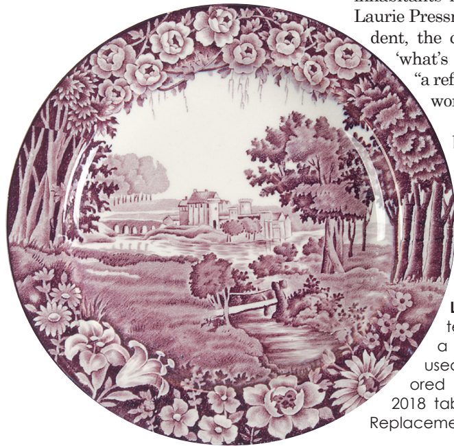
Left: A traditional china pattern such as "Castles" might be a bit overwhelming, but when used in conjunction with solid-colored chargers, it is perfect for a 2018 tablescape.

the hue "nuanced and full of emotion" as it symbolizes "experimentation and non-conformity," Ultra Violet "suggests the mysteries of the cosmos."