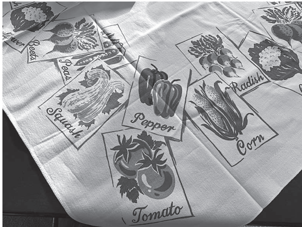
Above: This hard-to-find tablecloth is sure to inspire backyard gardeners.

If this has been helpful (or inspirational), might I suggest joining the Vintage Tablecloth Lovers Club? Go to www.vintage-tableclothloversclub.com and connect with kindred spirits.