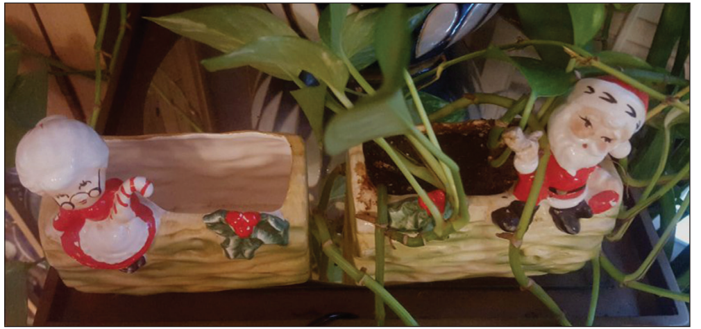
Above: Until the philodendron dies, the Santa planter on the right will remain on display year-round in Jimmie Bucci's home.