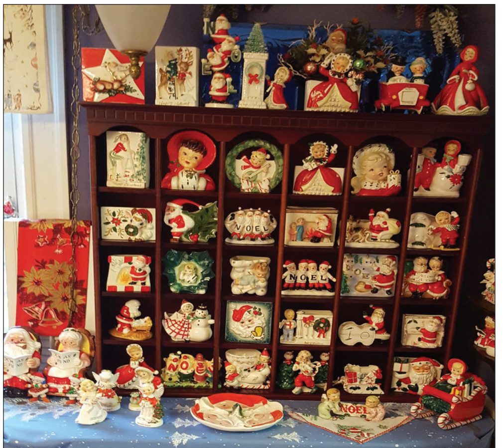
Below: A joyful corner in Bucci's home, featuring a display of planters. Head vases are particularly desirable because of their cross collectability.