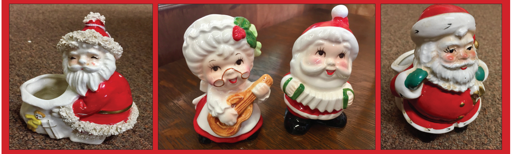
Above Left: This Santa, his sack an empty planter, was priced at $15.50 and for sale at the Emmitsburg (MD) Antique Mall. Not in mint condition, the addition of spaghetti trim makes him appealing to collectors. Above Middle: Pairs, such as Santa and Mrs. Claus, were popular when introduced more than a half-century ago. Above Right: One of the largest importers of mid-century Christmas ceramics was Lefton China. Note the hand-painted eyelashes and fur trim on this Santa planter, which bears that company's label.