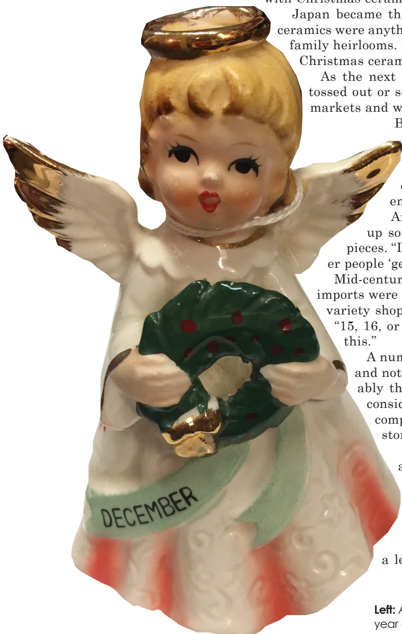
Left: A "December" angel. Companies that imported Christmas ceramics didn't stop there, as they offered month-of-the-year angels as well as birthday angels.