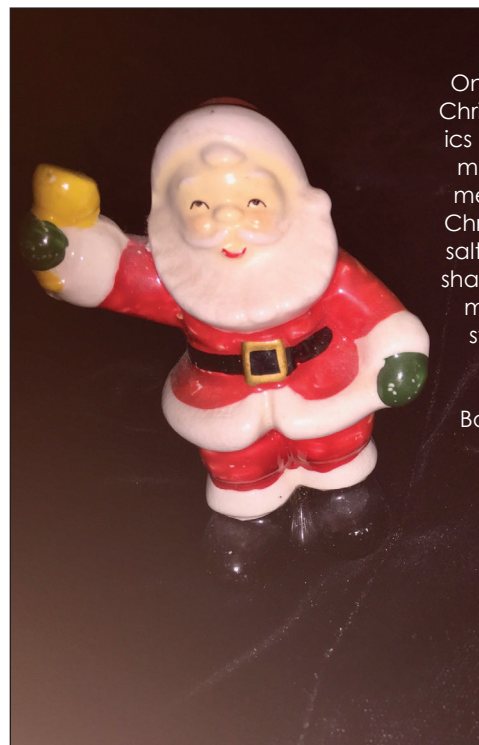
One thing most Christmas ceramics have in common is a sentimental view of Christmas. Santa salt-and-pepper shakers like these might be the start of a fun collection.