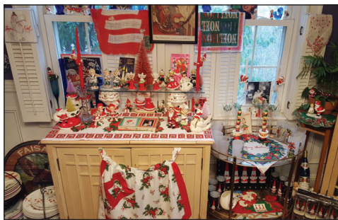
Above: Deck the halls with mid-century Christmas ceramics!

Right: A strange sight indeed: A ceramic Santa bobble head. This oddity was found at the Emmitsburg (Md.) Antique Mall and was priced at $45.