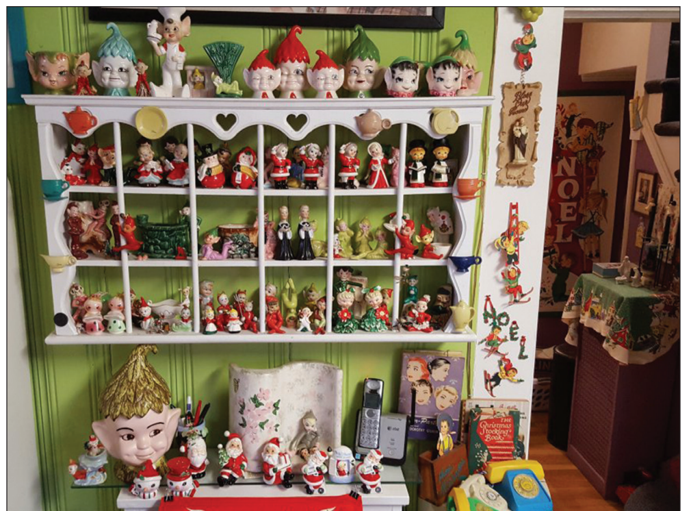
Above: Santas and elves and choristers – oh, my!